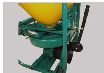
Rate adjustment handle