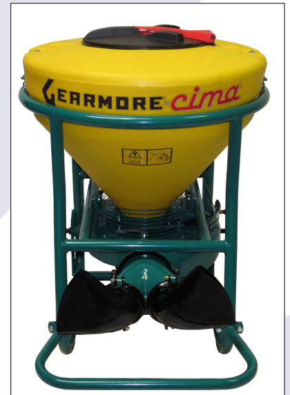
Model S420 shown